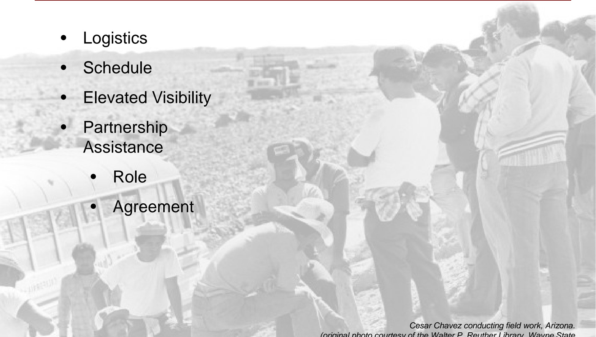
Cesar Chavez conducting field work, Arizona.