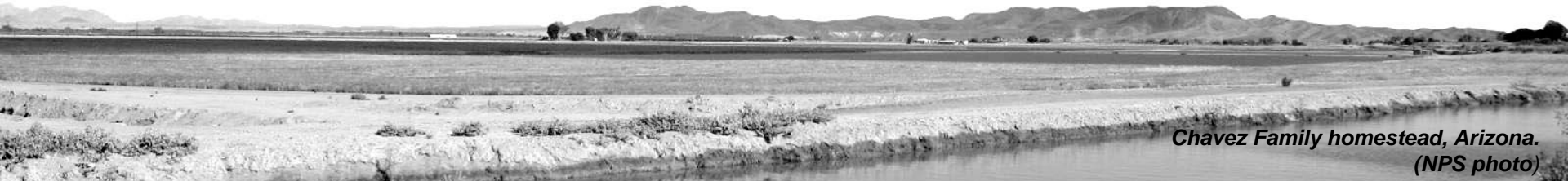
Chavez Family homestead, Arizona.

“...The National Park Service shall consult with the National Chávez Center, the César Chávez Foundation, and other appropriate organizations in planning for interpretation and visitor services at the monument...To the extent practicable and appropriate, the National Park Service shall seek to provide coordinated visitor services and interpretive opportunities with the National Chávez Center throughout the La Paz site, on property owned and managed by the National Chávez Center as well as on property administered by the National Park Service. The National Park Service is directed to use applicable authorities to seek to enter into agreements with the National Chávez Center to address common interests, including provision of visitor services, interpretation and education, establishment and care of museum collections, and care of historic resources.”